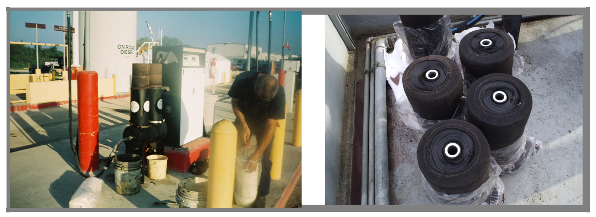
Depth-type filter elements full of water, bacteria, algae, microbes, and other solid particulates. These are the harmful contaminants that get through conventional pleated paper fitlers and cause premature filter clogging, injector faulures, costly down time, and high maintenance costs.