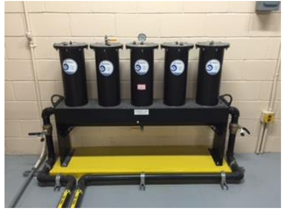
Model 5075 (65 gpm max.)