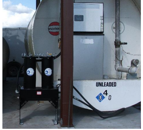
Model 2075 (26 gpm max.)