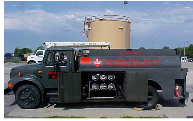
U.S Air Force installed Model 6075 (78 gpm max.)