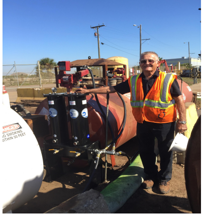
Model 2075 (26 gpm max.)