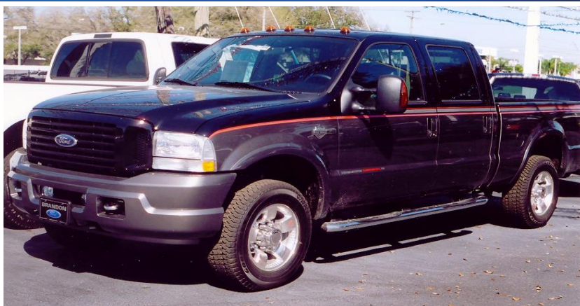
Model 285H Horizontal mount for Power stroke diesels