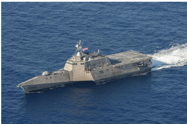
Model 290V installed for the U.S Navy LCS class